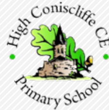
High Coniscliffe Church of England Primary School