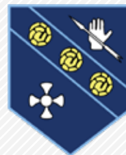
St Hild's College Church of England Aided Primary School